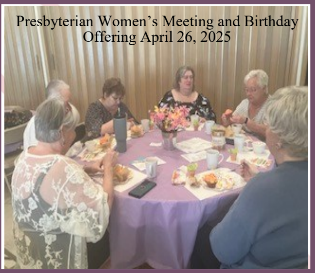
Presbyterian Women's Meeting and Birthday Offering April 26, 2025