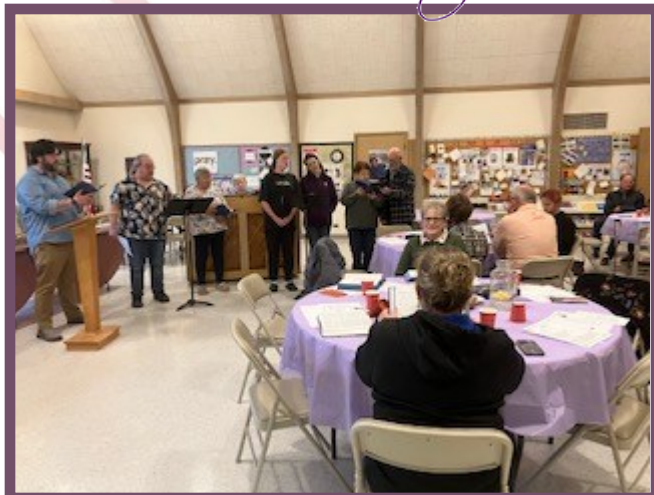
Maundy Thursday Communion Service and Meal April 17, 2025 at 6:00pm